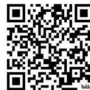
QR code for mobile view